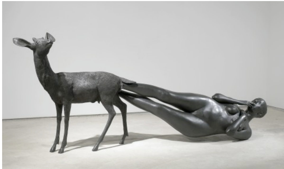
"Born." Kiki Smith. 2002. Bronze.